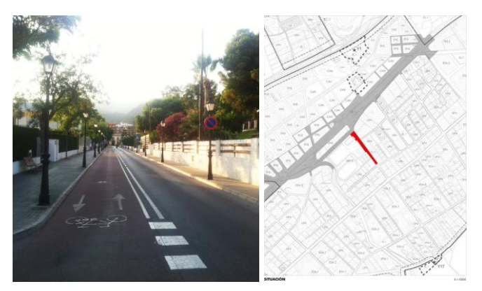
Figure 5. Location of the demonstrator

This scale allows addressing and responding to most of the technical requirements (compatibility with existing services and installations networks, etc.) and social use (responding to residents' vehicle traffic, emergencies and supplies, etc.), which usually occur in operations for renewing or regenerating public spaces. In addition, with the proposed surface, and as a function of the thicknesses and void index of the flooring base layers, storage volumes could be achieved in the infrastructure of the order of 300–400 m<sup>3</sup>. On the