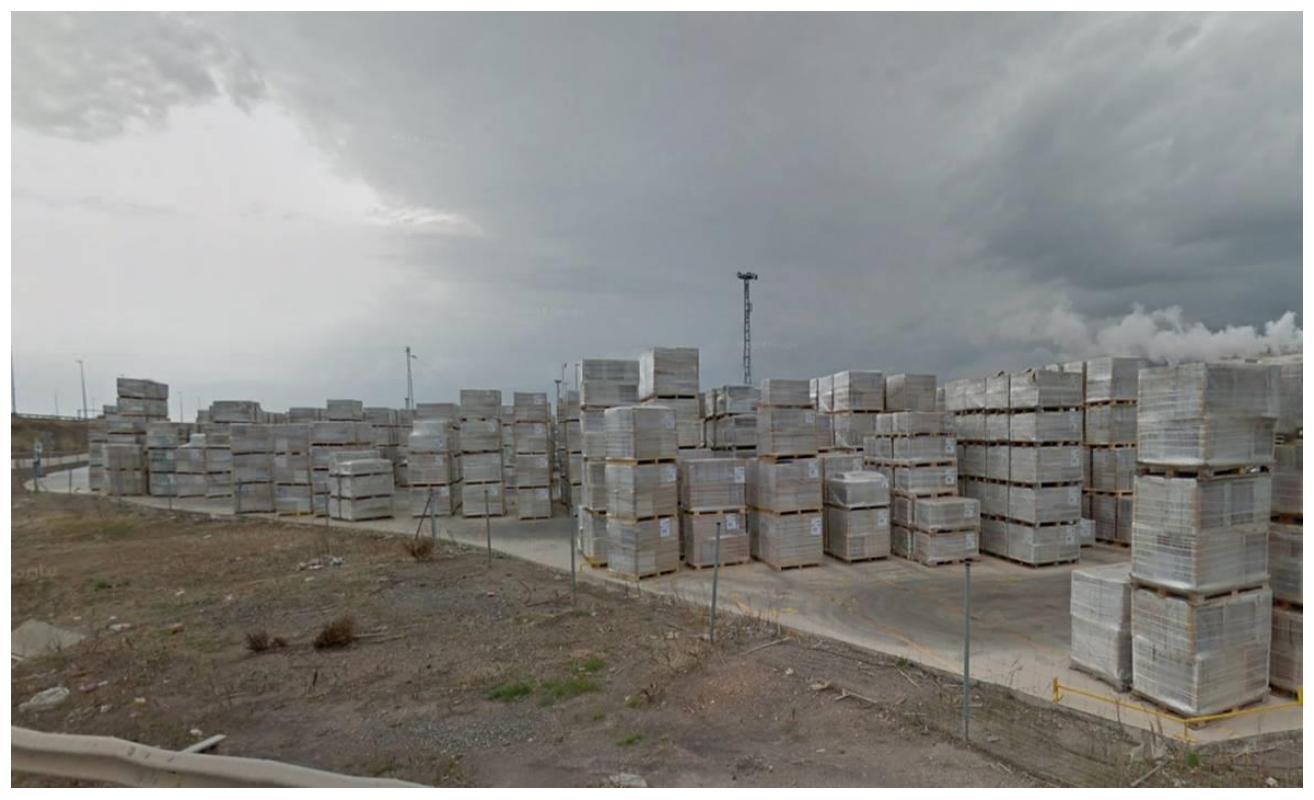
Figure 3. Stock of ceramic material with low commercial value

The collected data in the ceramic sector in Spain in the frame of this project is about 5,6 milion square meters.