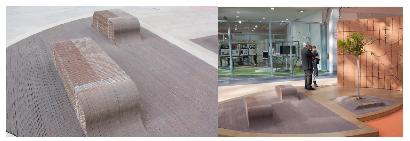
Figure 7. Previous project. Cevisama 2010

There are two European projects clearly related to SUDS: