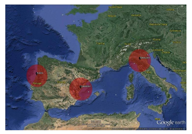
Imagen 4. Zonas de replicabilidad

LIFE CERSUDS is a readily replicable project because it will engage all the stakeholders needed for its implementation and the necessary documentation and procedures will be generated to enable authorities to incorporate and integrate these measures in their CC adaptation policies for rapid replication in other localities