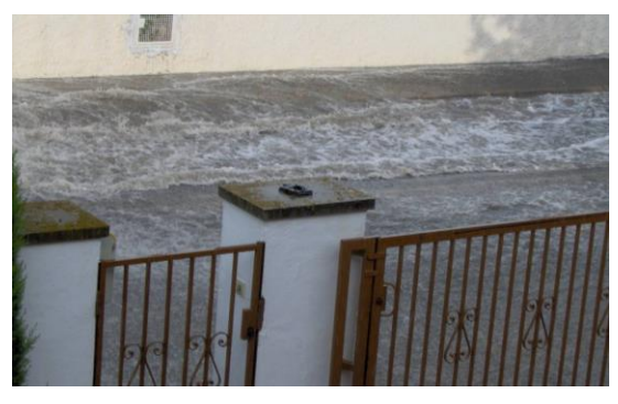
Figure 2. Flooding in Calle del Torreón. August 2008

In the case of Benicassim, these problems of droughts and torrential rains are particularly clear in the street where it is intended to locate the demonstrator. The photo in Figure 2, taken in August 2008, shows the flooding in the street where the demonstrator is to be built after a torrential episode in summer. The impermeability of the paving, together with the absence of an appropriate drainage system (scuppers), fosters surface run-off. This situation is frequent along the Mediterranean seaboard when convective rain episodes occur. The arising great downpours (exceeding 50 mm/h) in short periods of time generate large run-off volumes that cannot be adequately handled when the existing drainage system is ineffective and incapable of carrying the arising flow volume surges. In addition, when this problem occurs in towns with an orography like that of Benicassim, the problem is aggravated. The town's topographic profile perpendicular to the sea has large slopes in areas farther from the coastline, which decrease as they advance towards the coast. The result is a rapid build-up of the run-offs in the low part of the municipality where, because of the interference of the sea, the drainage systems are hard put to evacuate sudden, heavy cloudbursts. In view of this situation, the implementation of